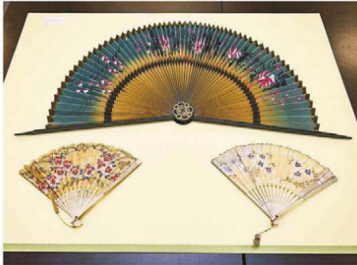
Nineteenth century fans and daguerreotypes, below, are part of Hofstra's Hart Nichols Collection, which spans 200 years, from 1730 to 1930, in the lives of two Long Island families.

But the administrative process of cataloging and preserving these collections takes time and funding — and not everything fits their mis-